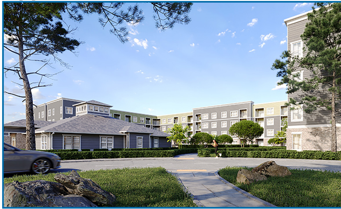
Images above and below are exterior renderings provided by Denton Floyd.

The City of Charlestown is excited to announce the intentions of the Denton Floyd Real Estate Group to construct a 206-unit multi-family apartment community in the city. Denton Floyd (out of Louisville, KY) is committed to building better communities and will revitalize Depot Street with the Forest Edge project.